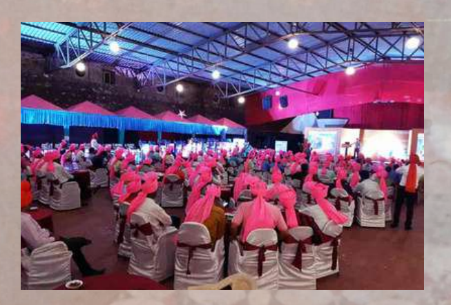
Play Station Conference Hall